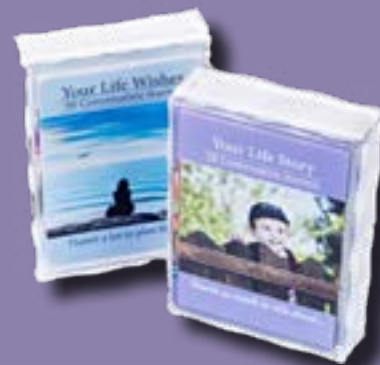
Your Life Talks Conversation Starter Cards

"Stories have to be told or they die, and when they die we can't remember who we are or why we're here" ...Sue Monk Kidd