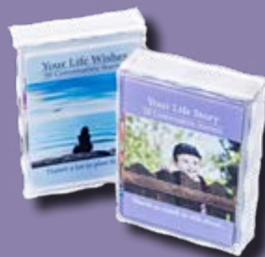
Your Life Talks Conversation Starter Cards

"Thank you so very much for your time and talk at Oxenford Bosom Buddies yesterday; the group loved the talk and really would love you to come back. Again, thank you so much for a really interesting talk - it did get quite a discussion going between the members."