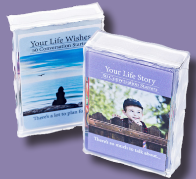
Your Life Talks Conversation Starter Cards

"Stories have to be told or they die, and when they die we can't remember who we are or why we're here" ...Sue Monk Kidd