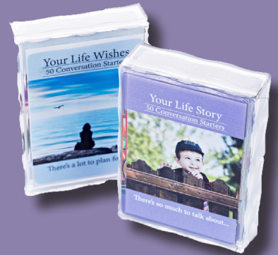
Your Life Talks Conversation Starter Cards

"Stories have to be told or they die, and when they die we can't remember who we are or why we're here" ...Sue Monk Kidd