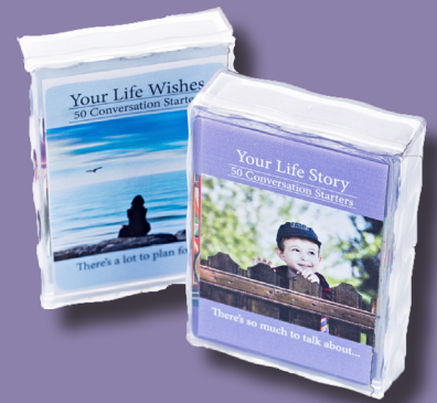
Your Life Talks Conversation Starter Cards